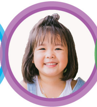
Frog Street Threes