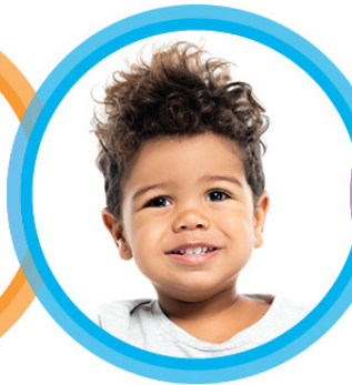
Frog Street Toddler