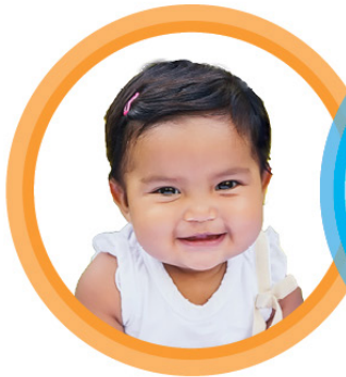
Frog Street Infant