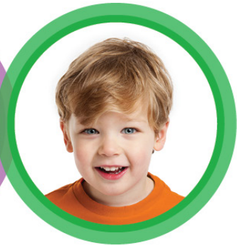
Frog Street Pre-K